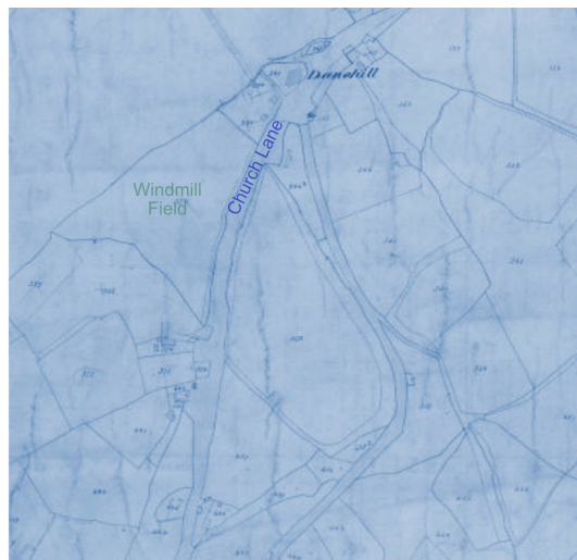
Above, Danehill on the 1841 Tithe Map.