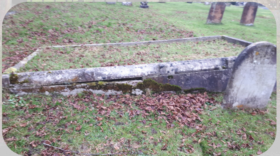
Harriett Wickham is buried at Danehill cemetery