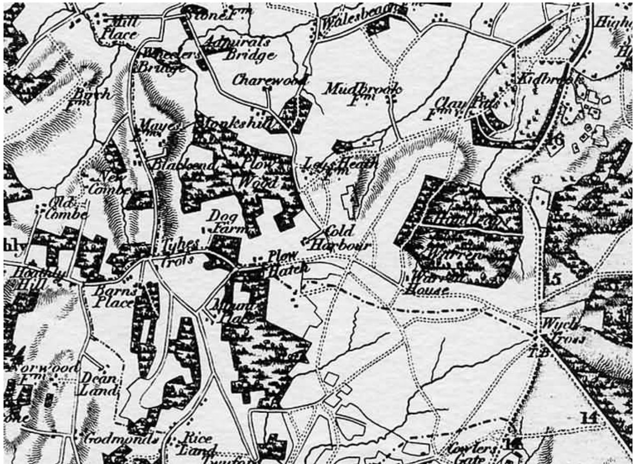
Figure 2. 1825 Map of Area North of Horsted Keynes with parts of West Hoathly and East Grinstead.