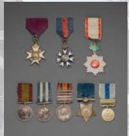
Great War C.M.G. group of ... bonhams.com